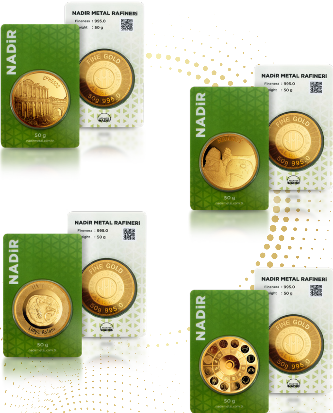
Metal: Au | Fineness : 995.0 | Weight: 50 gram | Shape: Rectangle