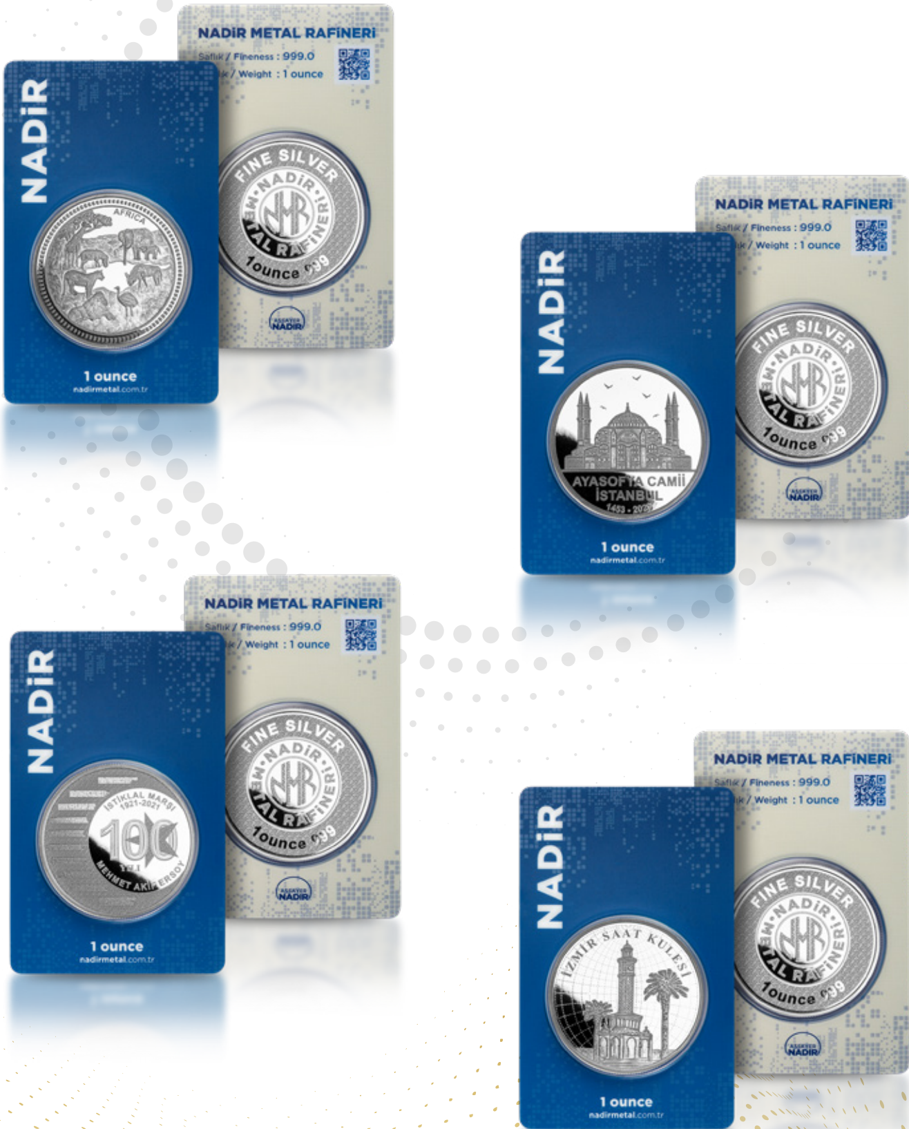
Metal: Ag | Fineness : 999.0 | Weight: 1 ounce | Shape: Rectangle