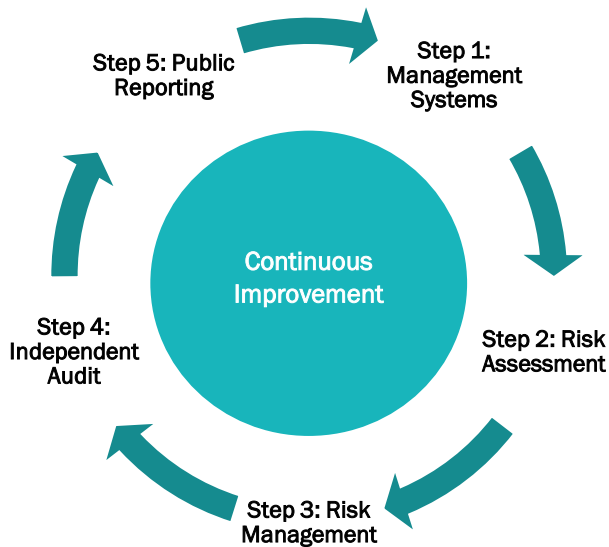
Figure 4: LBMA RSG Five-Step Due Diligence Framework